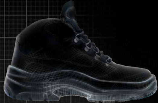
H E A V Y W E A R