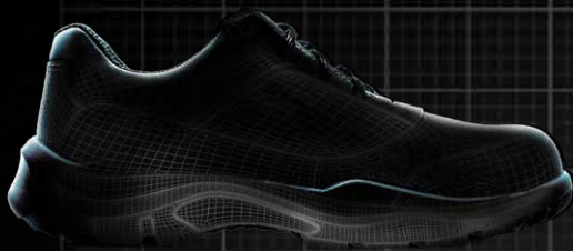
L I G H T W E A R

The 4 BOVA Category Ranges and the various sub-categories within them ensure that a client does not under-spec for some employees - and compromise on safety, or over-spec for others - and compromise on cost-effectiveness