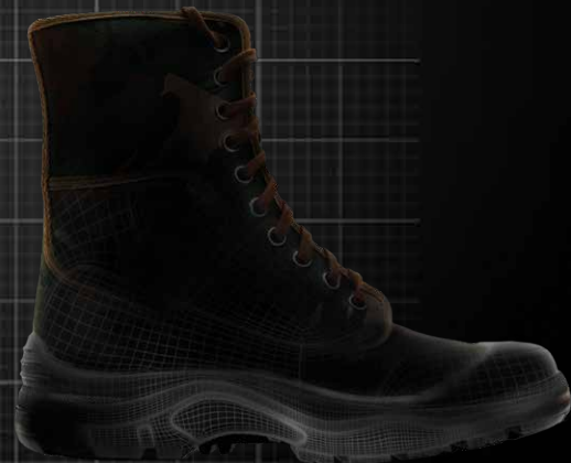
P A R A M I L I T A R Y