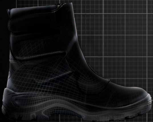
E X T R E M E W E A R